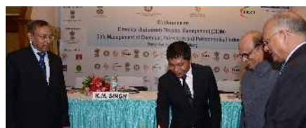
CIDM Shillong 2013 – Inaugurate by Hon'ble Chief Minister, Government of Meghalaya