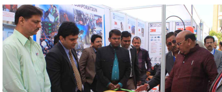
CIDM Indore, Madhya Pradesh 2015 – Inaugurated by Hon'ble Minister of Labour, Government of Madhya Pradesh