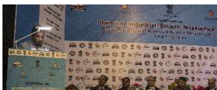
CIDM Shimla, Himachal Pradesh 2016 – Inaugurated by, Hon'ble Chief Minister, Govt of Himachal Pradesh