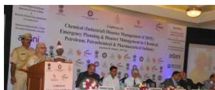
CIDM Goa 2014 – Inaugurated by Hon'ble The Governor of Goa