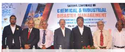
CIDM Mumbai 2016 inaugurated by Hon'ble Minister of Industries and Mining, Government of Maharashtra and Hon'ble Minister of Revenue, Relief and Rehabilitation, Public Works (excluding Public Undertakings), Govt. of Maharashtra