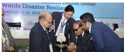
CIDM Shillong, Meghalaya 2015 – Inaugurated by Hon'ble Deputy Chief Minister of Meghalaya I/c Law, Water Resources, etc. Departments