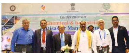
CIDM Hyderabad 2017 program attended by Shri Narshimha Reddy, Hon'ble Minister for Home, Prisons, Fire Services, Sainik Welfare, Labour & Employment, Government of Telangana.