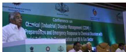
CIDM Trivandrum, Kerala – 2015 Inaugurated by Hon'ble Chief Minister, Government of Kerala