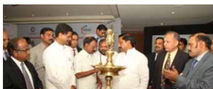
CBRN Hyderabad, 2012 – Inaugurated by Hon'ble Chief Minister of Andhra Pradesh